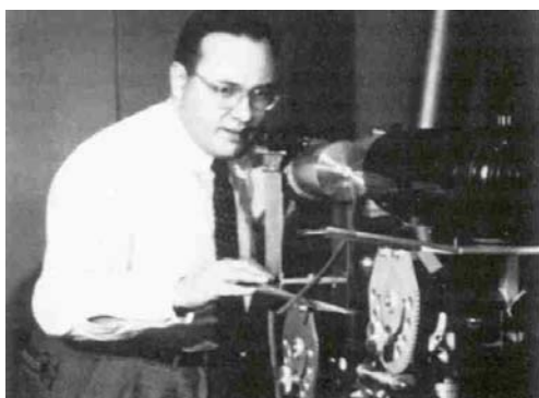
Figure 2. Arthur L. Schawlow during his laboratory investigations in 1960. He and Charles Townes developed in 1958 the concept which underlies the theoretical fundamentals of laser.

In the applied research, it is a common practice to have different scientists working on the same scientific problem, but only one of them is the first to get to the right solution. This was the case with the first laser. Unlike his predecessors, Theodore H. Maimans was the first to reach the long cherished goal by using an active medium of ruby crystal ( \text{Al}_2\text{O}_3 with \text{Cr}^{+3} ions) that was largely ignored by the other contemporary researchers (fig.3). Although his work at the Hughes Research could not enjoy the funding of his competitors working in the laboratories of IBM, Siemens, Bell etc, and though he himself was not regarded as a potential rival of their research, in the long run, he has actually won the race by creating the laser.