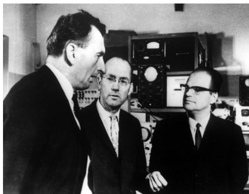
Figure 4. The 1964 Nobel prize winners for physics : left to right Alekander Prokhorov, Charles H. Townes and Nikolay Basov,

sov (fig.4) for their theoretical investigations in the field of quantum electronics, which brought about to the development of masers and lasers [6]. Another contemporary scientist, Schawlow, was awarded the Nobel Prize for 1981 for his research in the area of laser spectroscopy [7]. Thus Maimans remained empty-handed. Underrated by his fellow academicians, this scientist managed to offer his exquisite solution in terms of technology and application and gave the world a new type of light source that revolutionized science and technology.