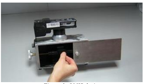
Figure 1. OMIS device

under the Brewster's angle and the second image of the sample is taken. Two images are processed with the convolution algorithm in MATLAB® 2013a (Math-Works, USA) and the optomagnetic spectra of the sample is obtained.